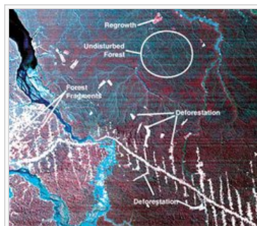
Satellite image of deforestation in the Amazon region, taken from the Brazilian state of Para on July 15, 1986. The dark areas are forest, the white is deforested areas, and the gray is regrowth. The pattern of deforestation spreading along roads is obvious in the lower half of the image. Scattered larger clearings can be seen near the center of the image.

Social scientists and land managers define land use more broadly to include the social and economic purposes and contexts for and within which lands are managed (or left unmanaged), such as subsistence versus commercial agriculture, rented vs. owned, or private vs. public land. While land cover may be observed directly in the field or by remote sensing , observations of land use and its changes generally require the integration of natural and social scientific methods (expert knowledge, interviews with land managers) to determine which human activities are occurring in different parts of the landscape, even when land cover appears to be the same. For example, areas covered by woody vegetation may represent an undisturbed natural shrubland, a forest preserve recovering from a fire (use = conservation), regrowth following tree harvest ( forestry ), a plantation of immature rubber trees (plantation agriculture), swidden agriculture plots that are in between periods of clearing for annual crop production, or an irrigated tea plantation. As a result, scientific investigation of the causes and consequences of LULCC requires an interdisciplinary approach integrating both natural and social scientific methods, which has emerged as the new discipline of land-change science .